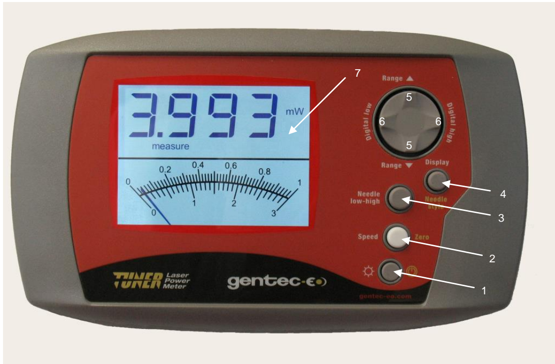
Fig. 1-1 TUNER Front Panel