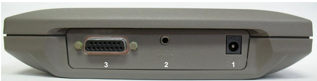
Fig. 1-2 TUNER Connectors