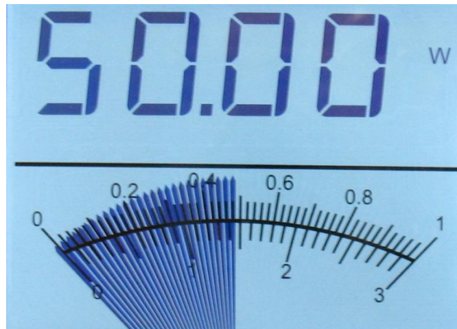
Fig. 1-5 Needle Display in Bar Graph mode

When the batteries are discharged enough to compromise the measurement, the TUNER displays "LO BATT" instead of the measurement. Refer to section 3 to replace the batteries.