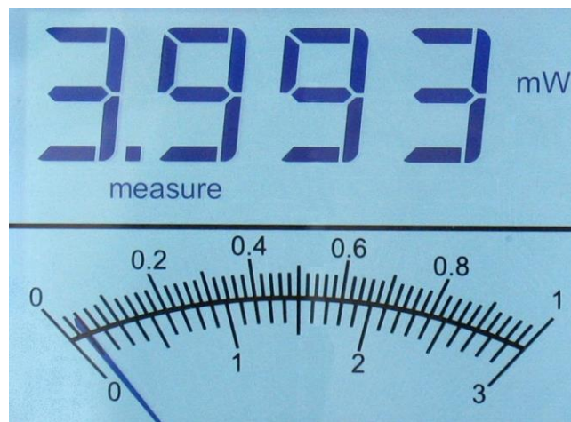
Fig. 1-3 TUNER LCD Display

The LCD provides measurement information, wavelength information, range information and other useful messages.