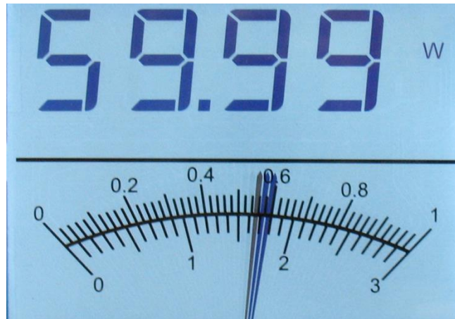
Fig. 1-4 Needle Display in Tail mode